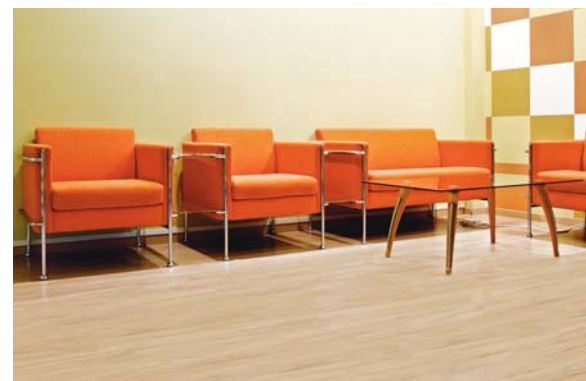
Antiqued White Pine