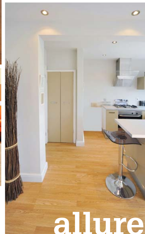
Viking Oak Classic