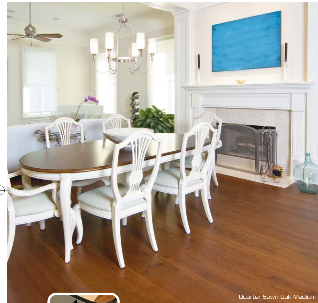
Quarter Sawn Oak Medium

Even while opening up the frontiers of creative design, Allure has always stayed true to its roots, with an expanding selection of natural wood look floors. The Traditional collection features beautiful oaks and chestnuts alongside classic walnut and cherry. Sensible, realistic, and environmentally wise, in this ever-changing world, Allure Traditional is a graceful means of keeping one's feet firmly planted on the ground.